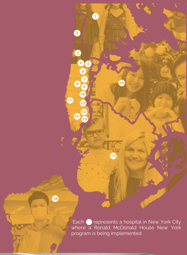
*Each ● represents a hospital in New York City where a Ronald McDonald House New York program is being implemented

We delivered 10,117 activity and snack packs to families at 11 different Hospitals.