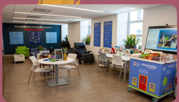
Ronald McDonald Family Rooms in hospitals provide quiet and supportive spaces for families battling pediatric illness

A Queens mother with a child in the Neonatal Intensive Care Unit that utilizes the Ronald McDonald Family Room in NYC Health + Hospitals/Elmhurst recently said: