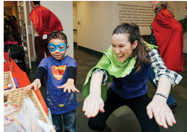
Eighty-seven family members enjoyed spending time at the Bohemian National Hall for our “Superheroes for a Day” event.

The second annual Superhero for a Day event was held at the Bohemian National Hall with nearly 200 attendees. A total of 87 family members from three of our partnering hospitals came, along with 43 family members from the Ronald McDonald House, 30 volunteers from the House and 40 event volunteers.