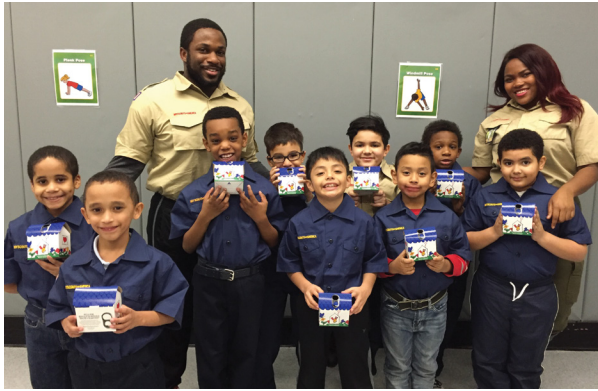
More than 400 participants in the Scoutreach program in New York City helped to raise awareness about childhood cancer by collecting pop tabs.