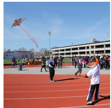
Participants in our Queens Kids Fun Run found it was a great day out on the track for the entire family.