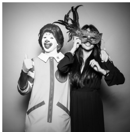
Annual Masquerade Ball organized by RMH-NY Board of Associates