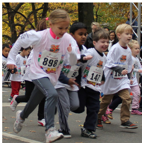
Kids Fun Run, Central Park