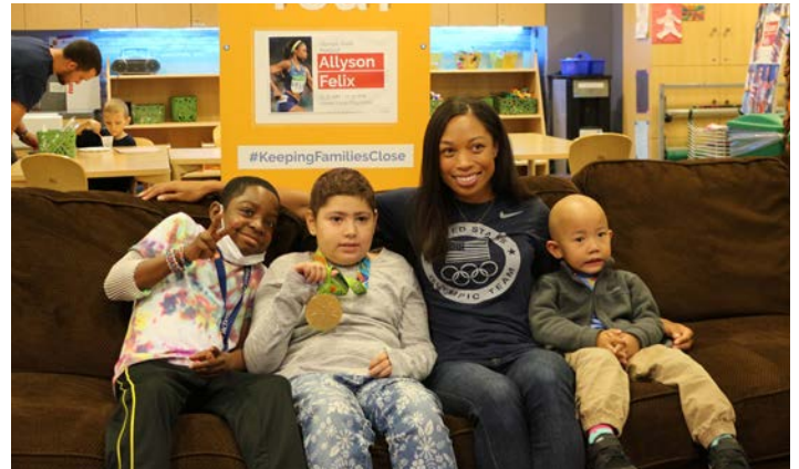
Allyson Felix pose with a few kids from the House along with her gold medal.