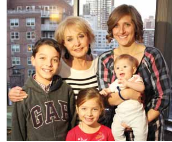
Barbara Walters with resident family