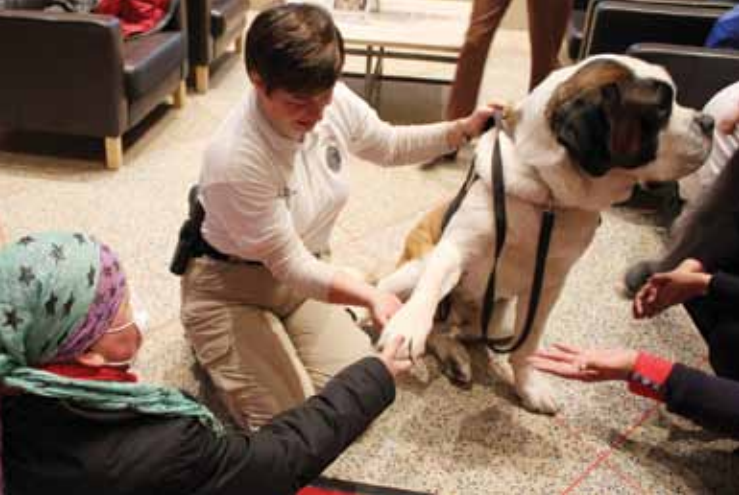
Newtown comfort dog Rosie greets House residents.