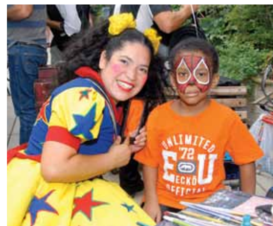
Happy faces, thanks to Children's Happy Faces Foundation.