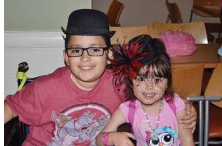
Tea party attendees.

communities and how their outreach to raise awareness can indeed make a difference in the lives of children battling cancer. The gala received additional musical support from the cast of “Motown: The Musical,” featuring a special rendition of “Reach Out and Touch” by actress and singer Valisia LeKae, who performs as Diana Ross in the Broadway musical.