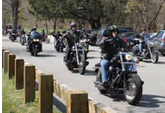
Kickstands up at Hogs for Hope.