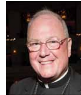
Timothy Cardinal Dolan