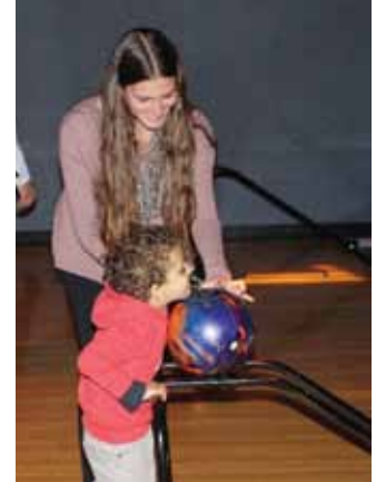
Above left: 2013 Hope Award Recipients. Above right and below: Youth committee members lending a hand by hosting a bowling event for families.