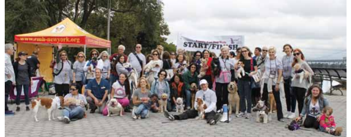
Therapy dog volunteers raise awareness during the Family Fun Day Dog Walk.

We are thankful to the people who give so generously of their time and resources to help us fulfill our mission and consider ourselves very fortunate to receive their gift of service.