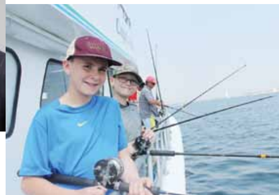
Camp Ronald fishing trip.

Education is a top priority for our families. It fuels children’s minds and imaginations, provides a vital sense of continuity and restores self-confidence. We work with