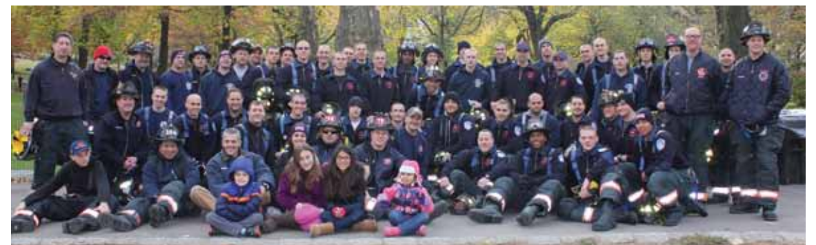
Yonkers Fire Department members provide ample support during the Kids Fun Run.