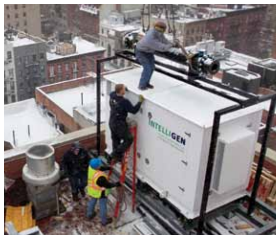
CHP installation in December 2013.

This green solution uses a single fuel source (natural gas) to generate electricity and recover the waste heat from the generation process to produce heat, hot water, and chilled water for air conditioning. The plant will generate more than one million kilowatt hours of electricity, per annum. At a cost of $1.2 million, the plant will save the House $270,000 per year with an expectation that it will pay for itself in only five years. We also received an $186,830 grant from the New York State Energy Research and Development Authority (NYSERDA) for the project.