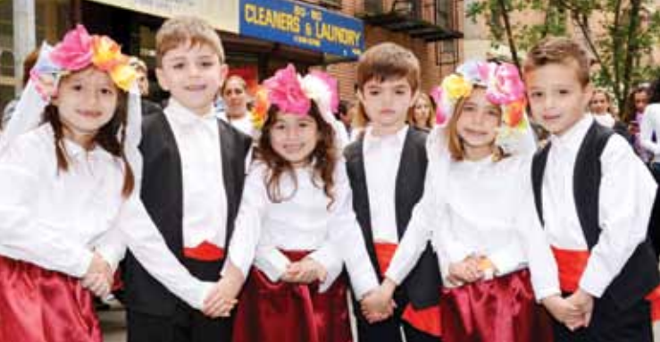
Young supporters of the Greek Walkathon.