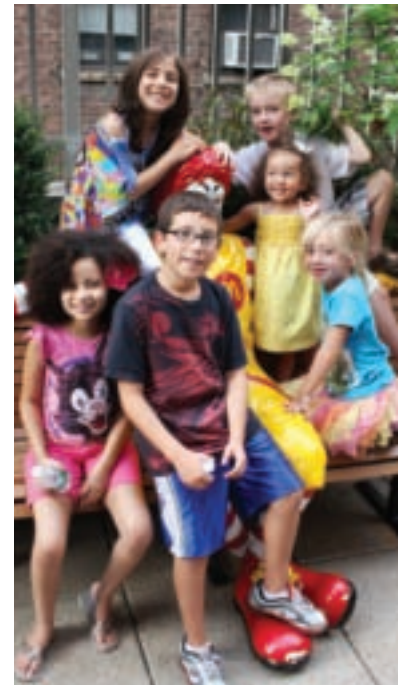
A moment in time, the picture of total health. Help us to make this a reality for all of our children.