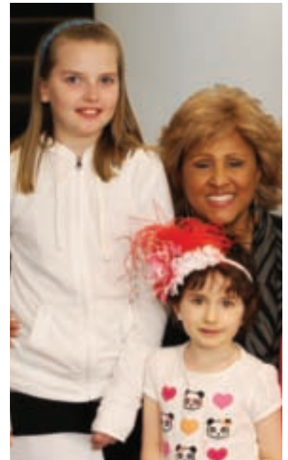
"It's All About Love" when Rock and Roll Hall of Famer Darlene Love spends time with our families.

This year, young residents also tried their hand at filmmaking, producing the House's second feature film, Twisted History (of the World) . With a full cast of 50 patients and siblings, the movie was shot over the course of the year. Volunteers helped write, produce,