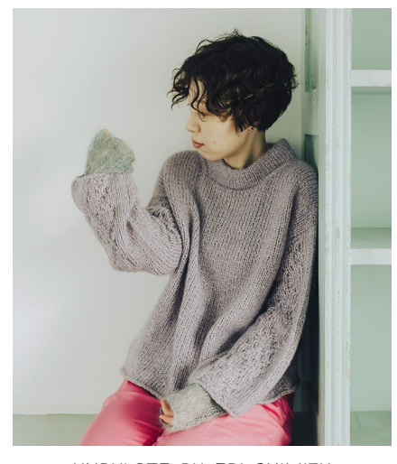
UNDULATE BY ERI SHIMIZU