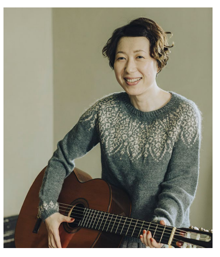
WALKING ON A DREAM BY RACHEL ILLSLEY

Sample is shown in (MC) #F7, 9 (10, 10, 12) (13, 13, 14) skeins, (CC) #F2, 1 skein