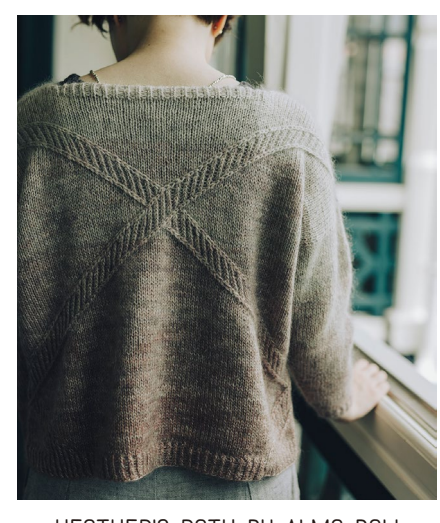
HEATHER'S PATH BY ALMA BALI

DARUMA GENMOU (100% merino wool; 165 yards / 151 m, 50g). Sample shown in #22 (MC) 3 (4, 4, 5, 5) (5, 5, 6, 6) skeins, #20 (CC1) 3 (3, 3, 3, 4) (4, 4, 5, 5) skeins, #19 (CC2) 2 (3, 3, 3, 4) (4, 4, 5, 5) skeins