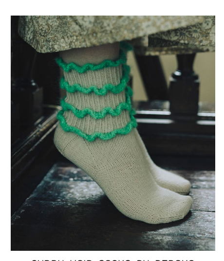
CURRY HAIR SOCKS BY DERAKO