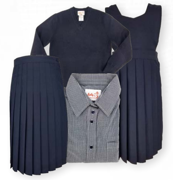
Bnos Yisroel Viznitz