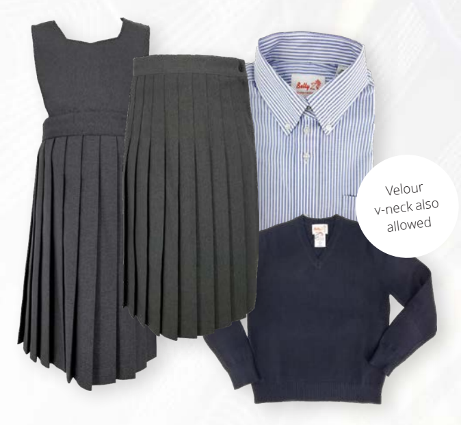
Bnos Derech Yisroel