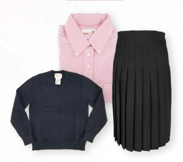
Ohel Blima Rochel D'Bobov