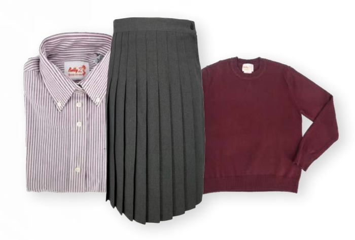
Bais Chinuch Gevoah