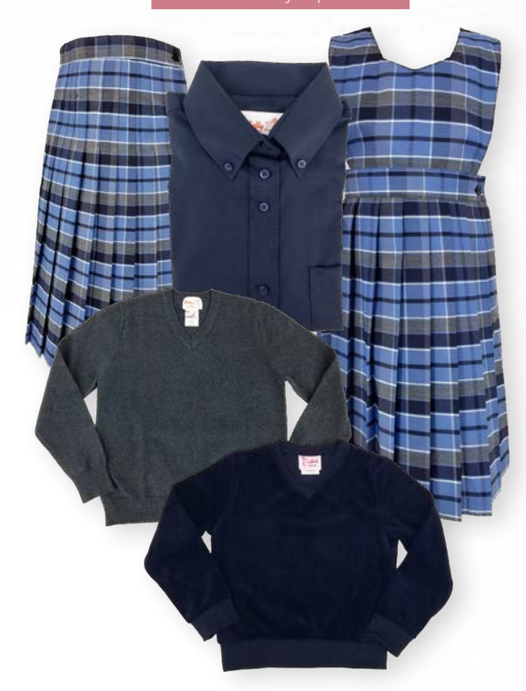
Satmar Bais Ruchel