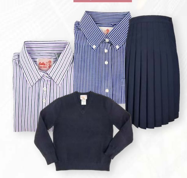
Pe'er Bais Yaakov