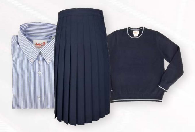
Monsey Bais Chaya Mushka