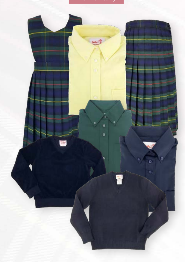
Ohel Blima Rochel D'Bobov