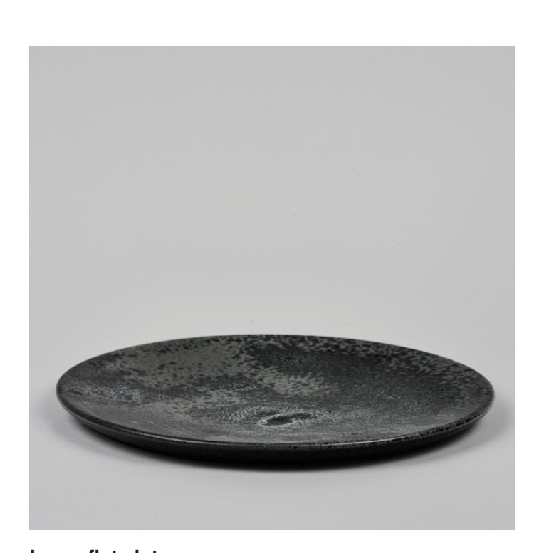
Large flat plate