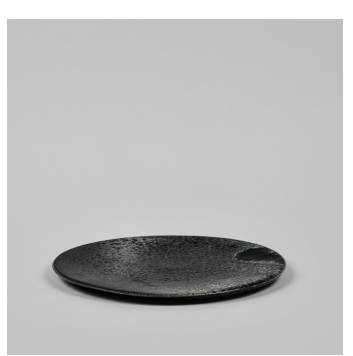
Medium flat plate