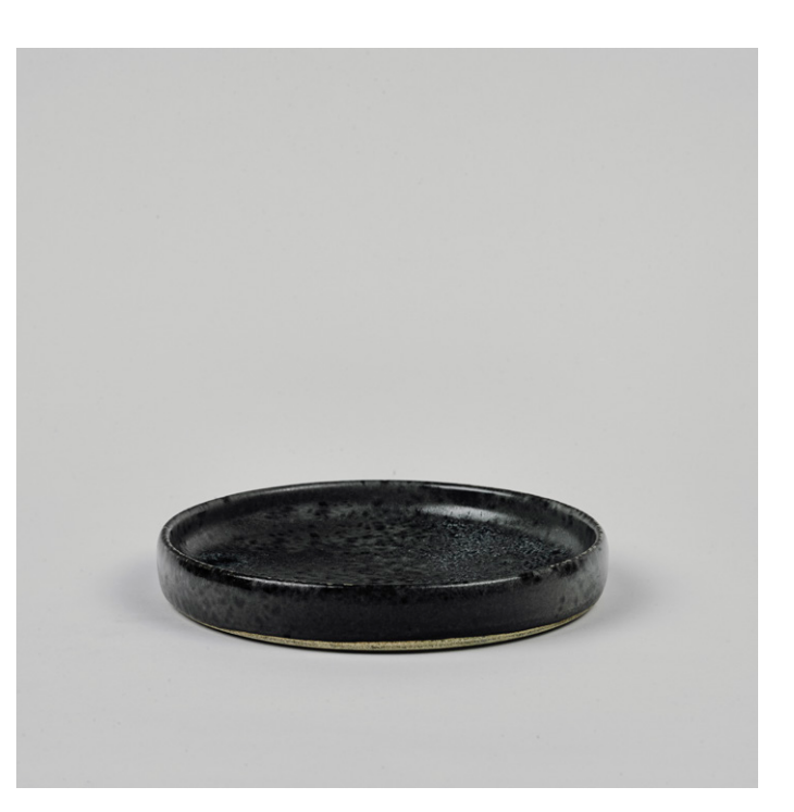
Medium rimmed plate