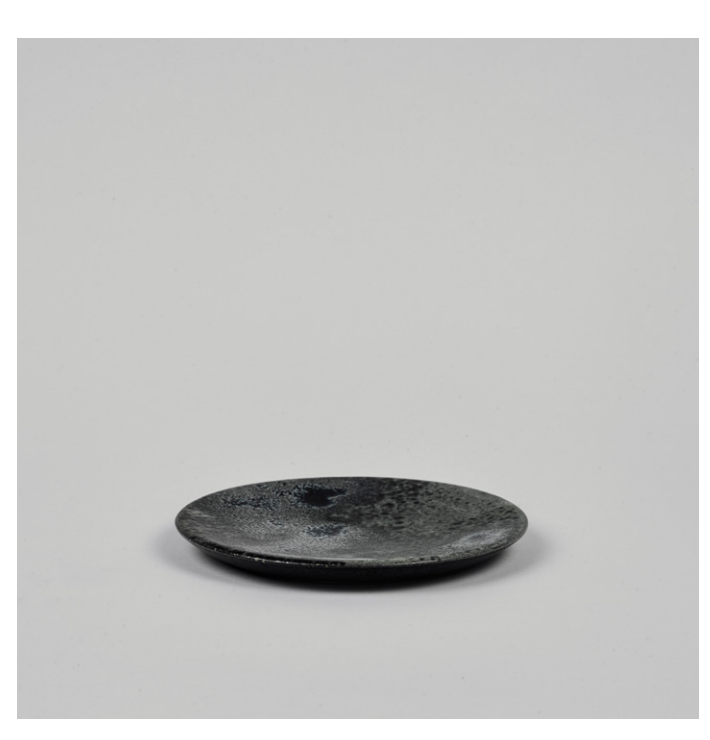
Small flat plate