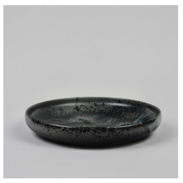
Serving platter D295 × H50 mm (#15)