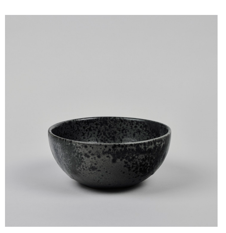
Medium deep bowl