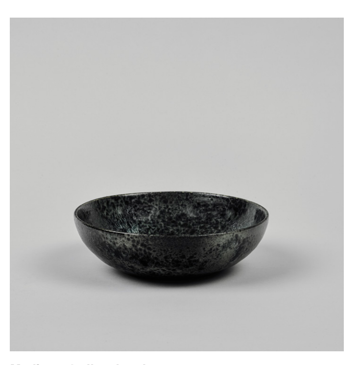
Medium shallow bowl