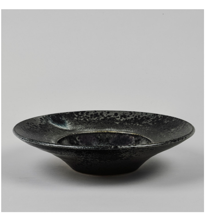
Large flat out bowl