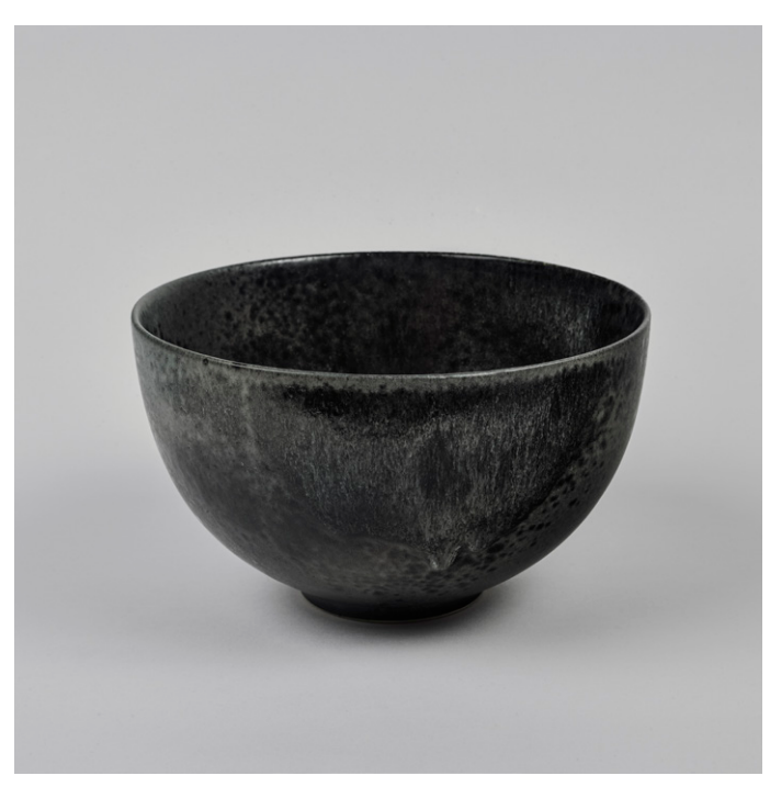
Large deep bowl