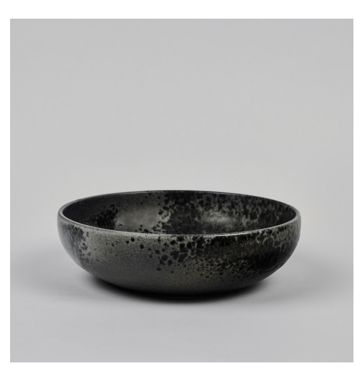
Large shallow bowl