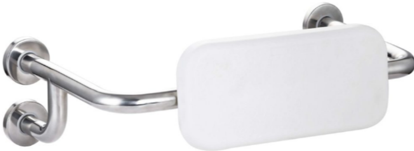
Code 1620033 Accessible Back Rest Padded Cushion