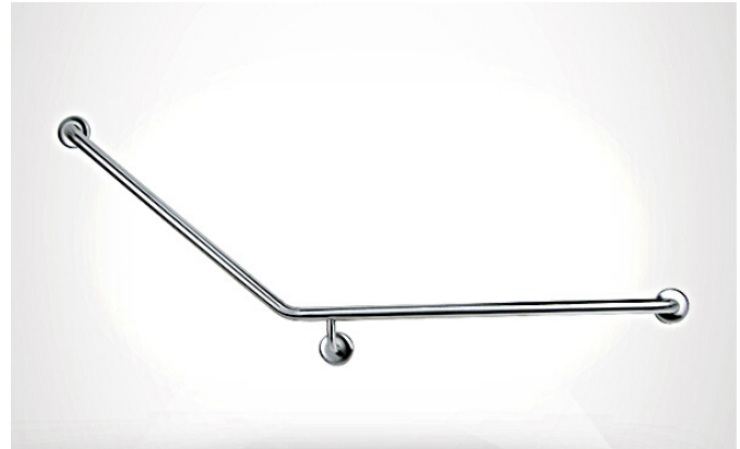
Code 1636631 45 ° Toilet Right Hand Rail 850mm x 700mm

To be used in conjunction with a 300mm rail Note: Left Hand when sitting on toilet