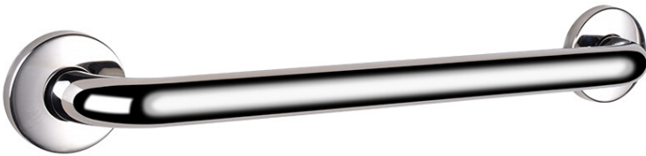
Code 1603567 600mm Grab Rail