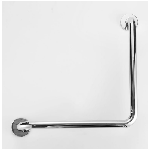
Code 1636629 90 ° Ambulant Toilet Grab Rail 450mm x 450mm