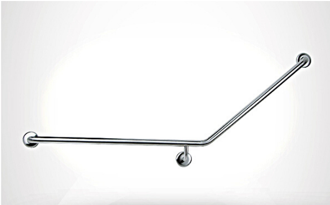
Code 1636630 45 ° Toilet Left Hand Rail 850mm x 700mm

To be used in conjunction with a 300mm rail Note: Left Hand when sitting on toilet