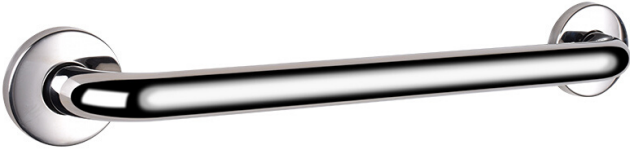
Code 1603566 450mm Grab Rail