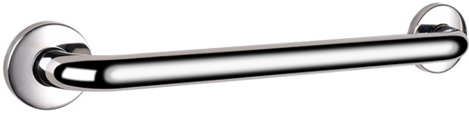
Code 1603565 300mm Grab Rail