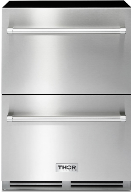
Product: 24 Inch Indoor Outdoor Refrigerator Drawers