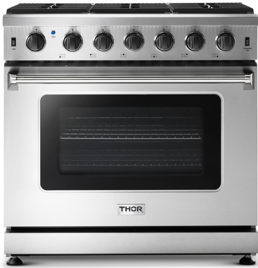
Product: 36 Inch Gas Range in Stainless Steel Model Number: LRG3601U / LRG3601ULP