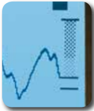
A real-time bar gauge shows you the depth of your chest compressions so you can maximize your CPR performance.

The American Heart Association and the European Resuscitation Council emphasize the importance of CPR feedback. "CPR quality measurement is needed to provide timely feedback to the responding providers." 1 The ZOLL® AED Pro® provides the feedback both the professional and the lay rescuer need to perform optimal CPR.