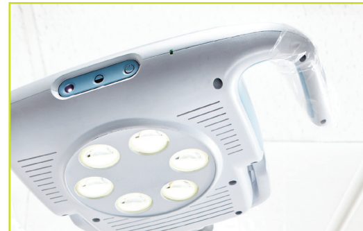
Disposable Sheath Available—Part #52630

The GS 900 Minor Procedure Light features: