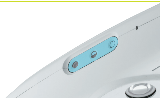
Touchless On/Off with Dimming Control