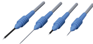
Disposable SuperCut™ Needles Electrodes †