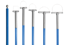
Disposable LLETZ/LEEP Loop and Ball Electrodes †