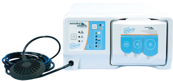
SE02 Smoke Evacuator †