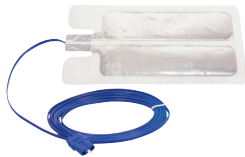
ESREC - Split Disposable Return Electrode with cord †