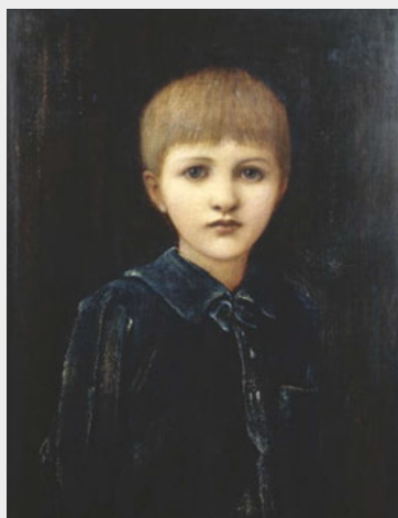
Denis Mackail painted by his grandfather, Sir Edward Burne-Jones

His niece Angela Thirkell would write movingly about him in her book Three Houses . But she concluded: ‘Two things told fatally against him. He never needed to work, and he was