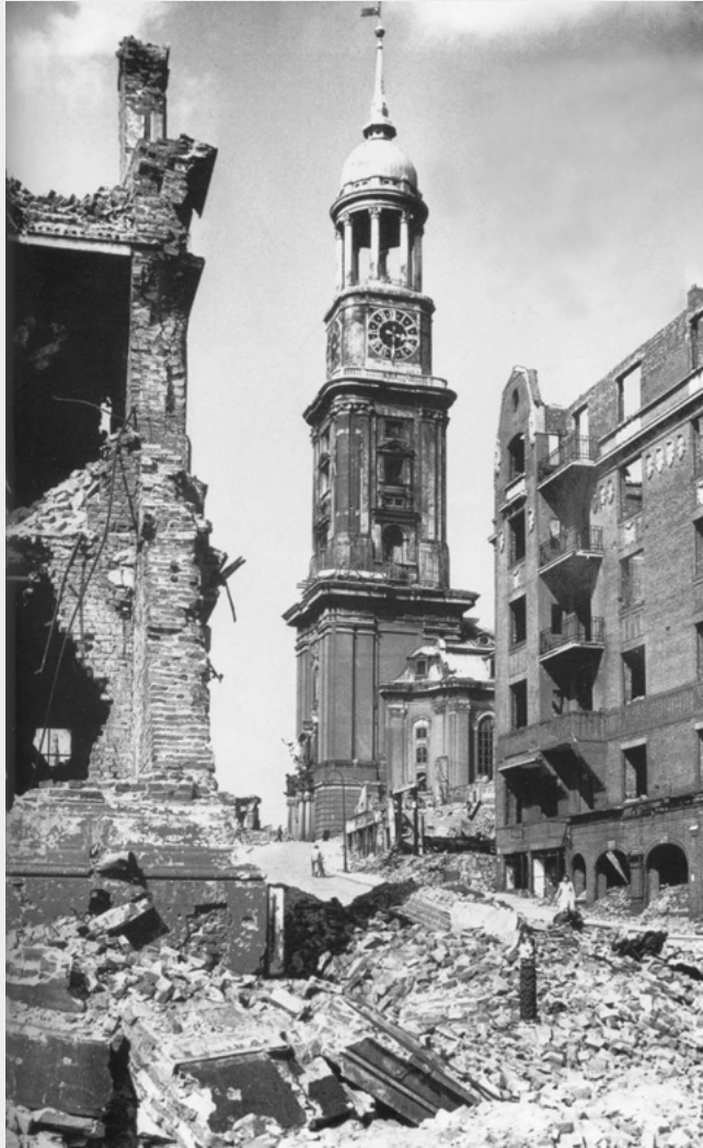
The 'Michel', an unscathed spire that was as important a symbol to the people of Hamburg as St Paul's was to Londoners

husband and only allowed to see her children on Wednesday afternoons, a man puts flowers on his late wife's grave – but the effect on our empathy for, and understanding of, her characters is profound. Dorothy Whipple is a deeply observant and