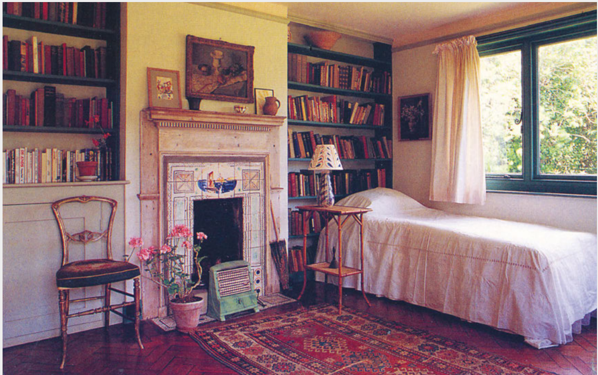
Virginia Woolf's bedroom at Rodmell today (as it would have been in the 1930s).