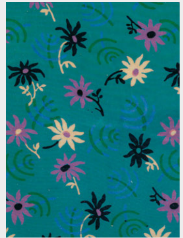
A 1930s dress fabric used for The Closed Door and Other Stories