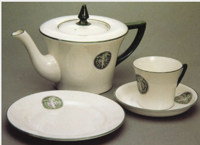
Women's Social and Political Union tea-set c.1910

It's near the dinner hour and the girls are getting hungry; they haven't heard a peep from their mothers. Pinkie Pie and Sun Sparkles have been to the castle about a zillion times; they've flown in the blue balloon, late for the costume ball, and then arrived, the 'My Little Pony' theme song playing as Pinkie Pie