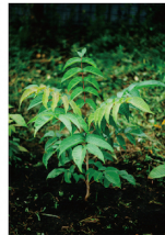
A two-year old urushi tree.