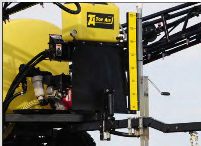
Fill Level Gauge