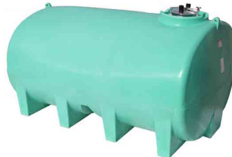
*Mounting Pins Required = 8 x AZP04