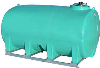
*Mounting Pins Included = 8 x AZP04

Green & black are standard colors, yellow & white are available on special request.