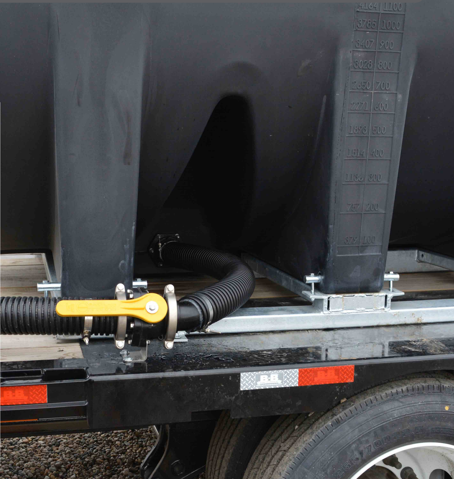
Featured Image: (100% drain-out) 2,500 Gallon Sump Bottom Transport Tank (THD02500K)