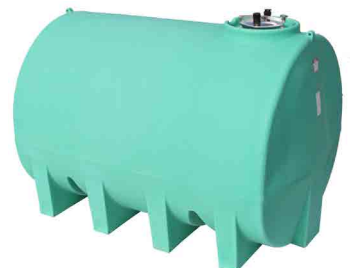
*Mounting Pins Required = 8 x AZP04