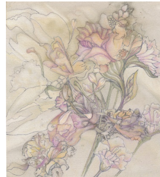
Enhanced Eco-Dyed Background