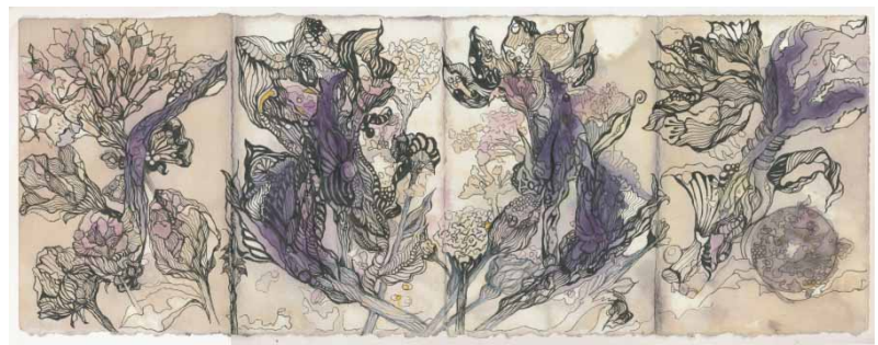
Enhanced Eco-Dyed Background