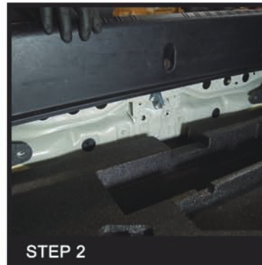
STEP 2 Remove the trunk trim panel cover