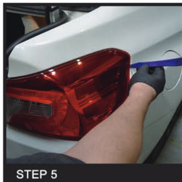
STEP 5 Remove the factory tail light housing