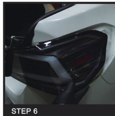
STEP 6 Seat the new tail light assembly in place