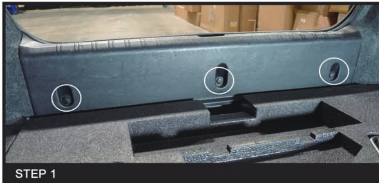
STEP 1 Remove the three plastic clips