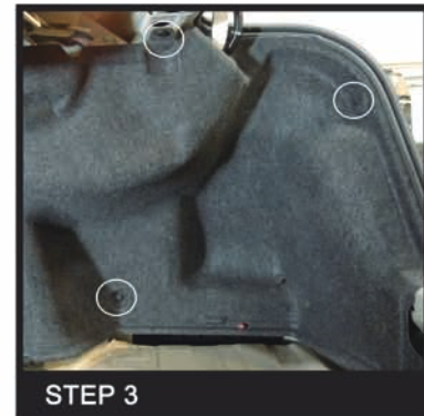
STEP 3 Remove the three plastic clips and pull out the trunk side liner cover to access the back of the tail light