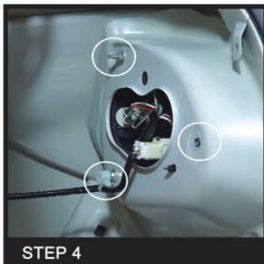
STEP 4 Disconnect the tail light harness and remove the three 8mm tail light mounting nuts