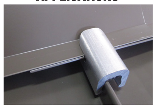
The MRC SNOW TRAX is shown installed with the colored rail.