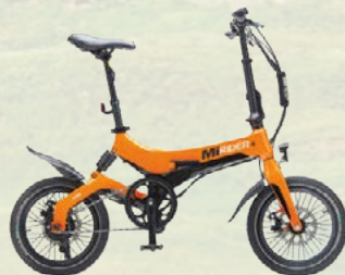
MiRider folding eBike

In addition to our own brand of eBikes, Mark2 Bikes can also supply a wide range of the latest UK specification eBikes together with the provision of servicing and repairs to you and your employees.