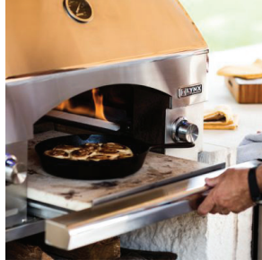
MOVEABLE COOKING SURFACE