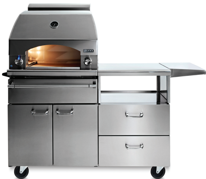
SHOWN ON 54" MOBILE KITCHEN CART