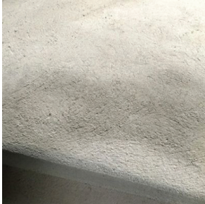
CONCRETE REFRACTORY DOME

The Napoli Outdoor Oven™ is always evolving. That philosophy is reflected in its features. We've refined these features to give you a cooking experience that's both simple and stunning.