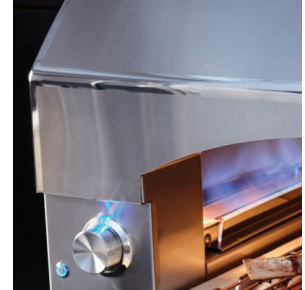
SEAMLESS WELDED CONSTRUCTION