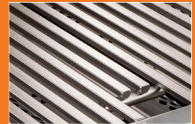
Diamond Sear Cooking Grids