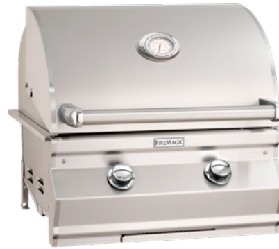
Choice C430i, 24" Built-In Grill C430i-RTIN*