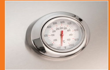
Angled Analog Thermometer