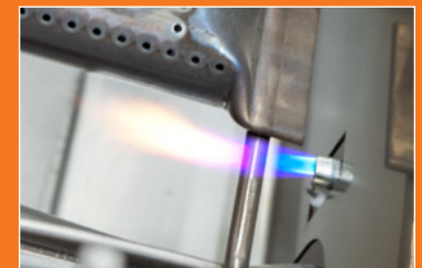
Turn-to-Light Ignition System