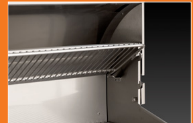
Adjustable, Dual Position Warming Rack