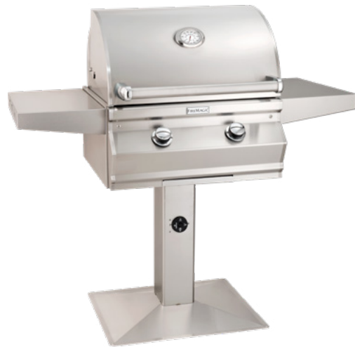
Choice C430i, 24" Patio Post Mount Grill C430s-RTIN*-P6