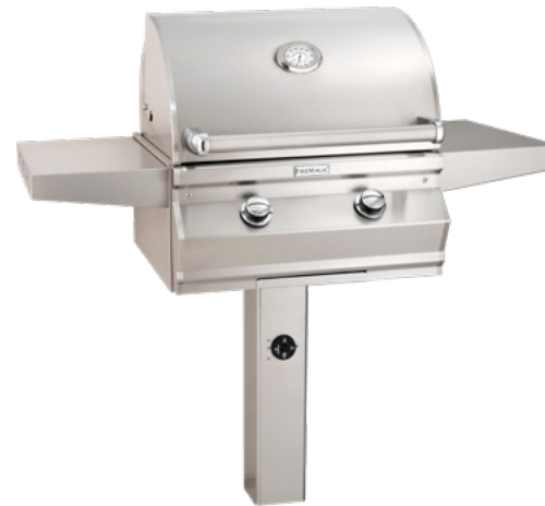
Choice C430i, 24" In-Ground Post Mount Grill C430s-RTIN*-G6