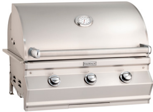
Choice C540i, 30" Built-In Grill C540i-RTIN*