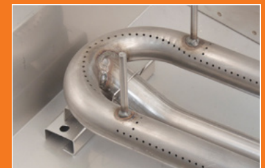
U-Shaped S.S. Burners