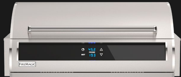
EL500i-3Z1E - One Control, no Window