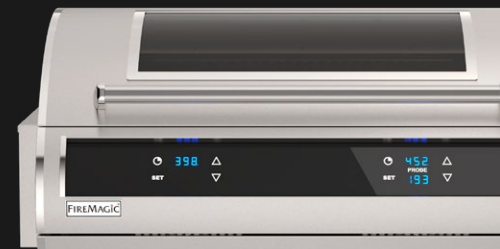
EL500i-4Z1E-W - Two Controls, Window

Bluetooth technology enables control from a smartphone