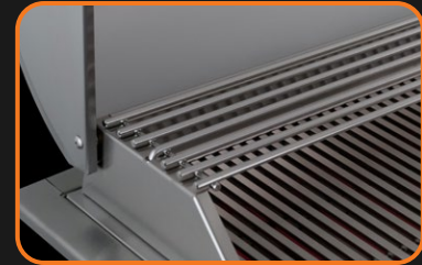
Heavy Duty Warming Rack