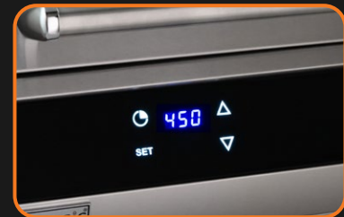
Touch Screen Control with Digital Thermometer and Bluetooth