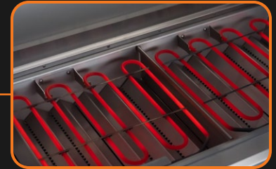
Heavy Duty Dual Heating Element powered by 240 vac/ 30amp circuit