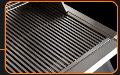
Diamond Sear Cooking Grids