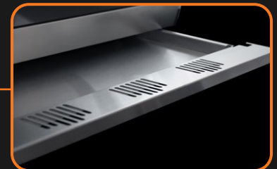
Easy-to Use Large Drip Tray