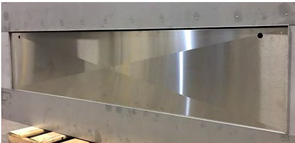
Weather Cover is installed.

STEP 2: Insert right side of Weather Cover into fireplace opening. Slide to the right until gap is closed.