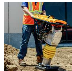
ACHIEVE 100% COMPACTION With a force of 3550 lbs/ft, compact soils up to 26" and master your next compaction test