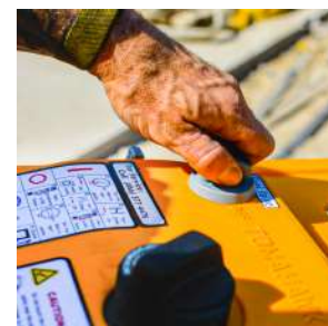
3-IN-ONE FUEL SYSTEM With one turn, eliminate carburetor issues and extend the life of your rammer