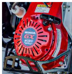
3.6 HP HONDA ENGINE Powered by the industry's most reliable engines with spare parts available nationwide