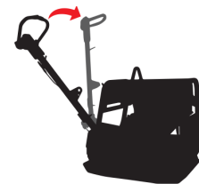
Hydraulic Reversible Drive System