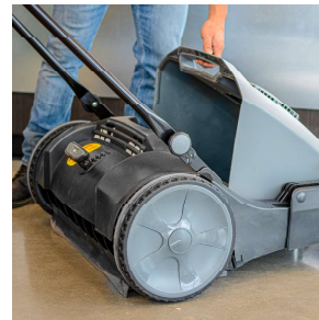
LARGE HOPPER Collect up to 14.5 gallons of dust and debris quickly

[LIGHTWEIGHT & COMPACT] Capable of fitting through doorways. Fully foldable to store out of sight!