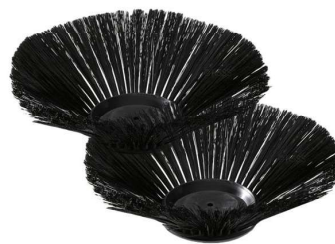
ROBUST BRISTLES Long-lasting nylon bristles designed to collect dirt and litter!