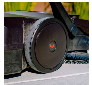
RUGGED WHEELS Easily clean up against walls, curbs, tight spaces, and more!