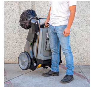
LIGHTWEIGHT/COMPACT Sweeper fits through doorways and can easily be carried