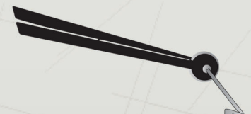
Saw guide ensures straight cuts