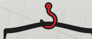
Lifting bar for easy transport