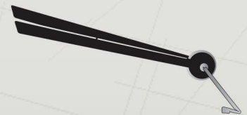
Saw guide ensures straight cuts