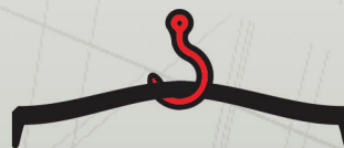
Lifting bar for easy transport