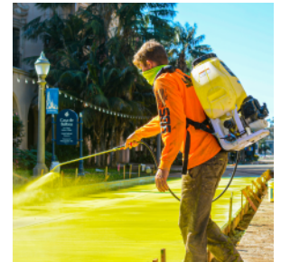
HANDLES HIGH SOLIDS Capable of handling up to 30% solids content heavier binders, pigments, and additives