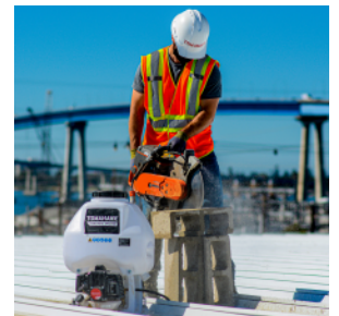
OPTIONAL ACCESSORIES Water Supply Adapter Portable Trolley Cart