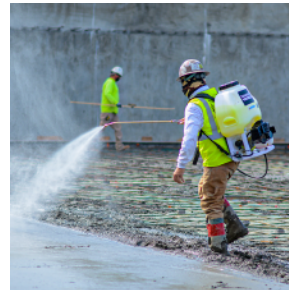
SPRAY 10,000-FT IN 10 MIN. Using any water-based concrete cure, retardant, form release, or sealant products

[OPTIONAL WATER SUPPLY] Simply hook up the Tomahawk sprayer to your concrete cut off saw using this exclusive adapter and make cuts anywhere from masonry, concrete, asphalt, rebar, and more!