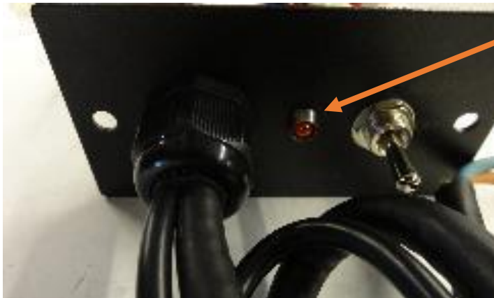
Red Indicator Light

If your thrower did not come with a safety pin you have a 3.0 you have an automotive fuse.