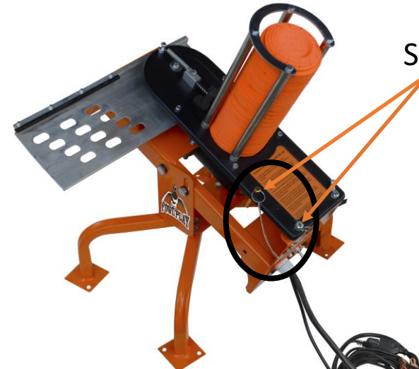
Safety Pin is located here