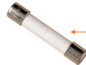
Raven 2.0 Fuse