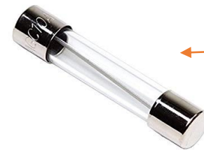
Fowl Play 2.0 Fuse

Inline Fuse located here. ( This is under the main frame toward the back of the machine)