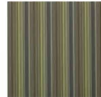
Midnight Orange - 2306