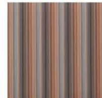
Midnight Grey - 2308