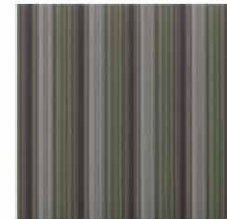
Highlight Grey - 2304