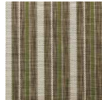
Shanghai - 2104