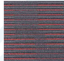
Red on Black