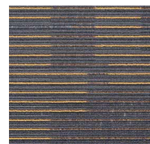
Gold on Black