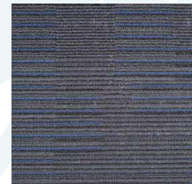
Oxford Blue on Black