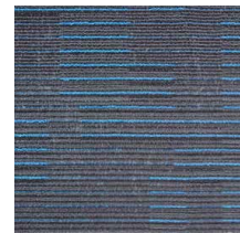
Sapphire on Black