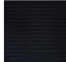
Black on Black