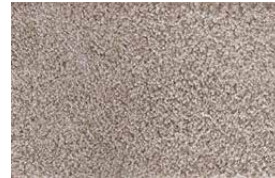
51 - Natural