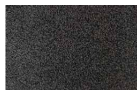
79 - Midnight