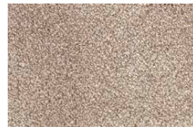
55 - Sand