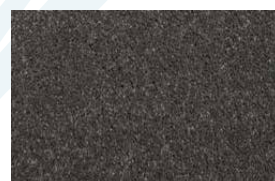
78 - Shadow Grey