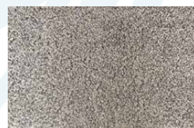
77 - Slate