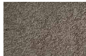
56 - Camel