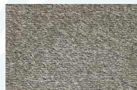
73 - Ash