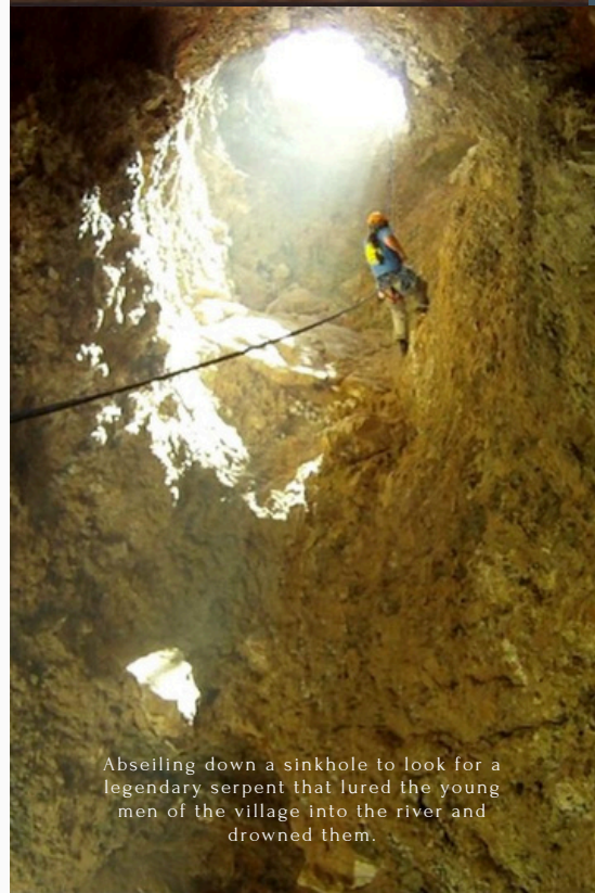
Abseiling down a sinkhole to look for a legendary serpent that lured the young men of the village into the river and drowned them.