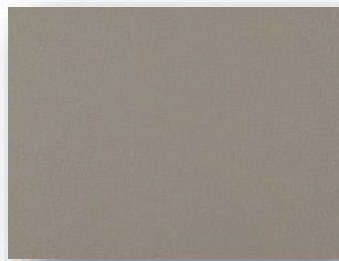
Grade A Dillon Stratus R103