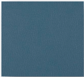
Grade A Dillon Blue R105