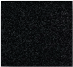
Grade A Dillon Black R107