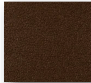
Grade A Dillon Java R102