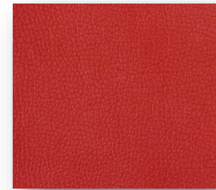
Grade A Dillon Lipstick R100