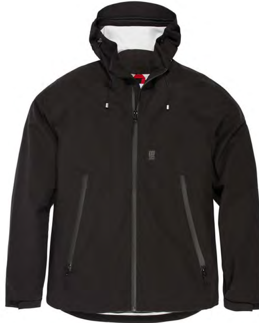
MEN'S - BLACK SIZING S-XXL