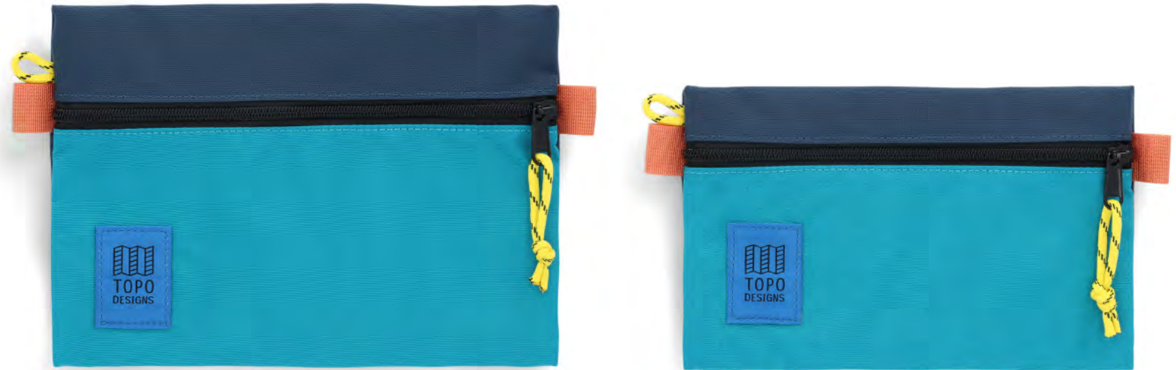
TILE BLUE/POND BLUE