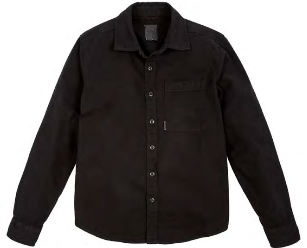
WOMEN'S - BLACK SIZING XS-XL