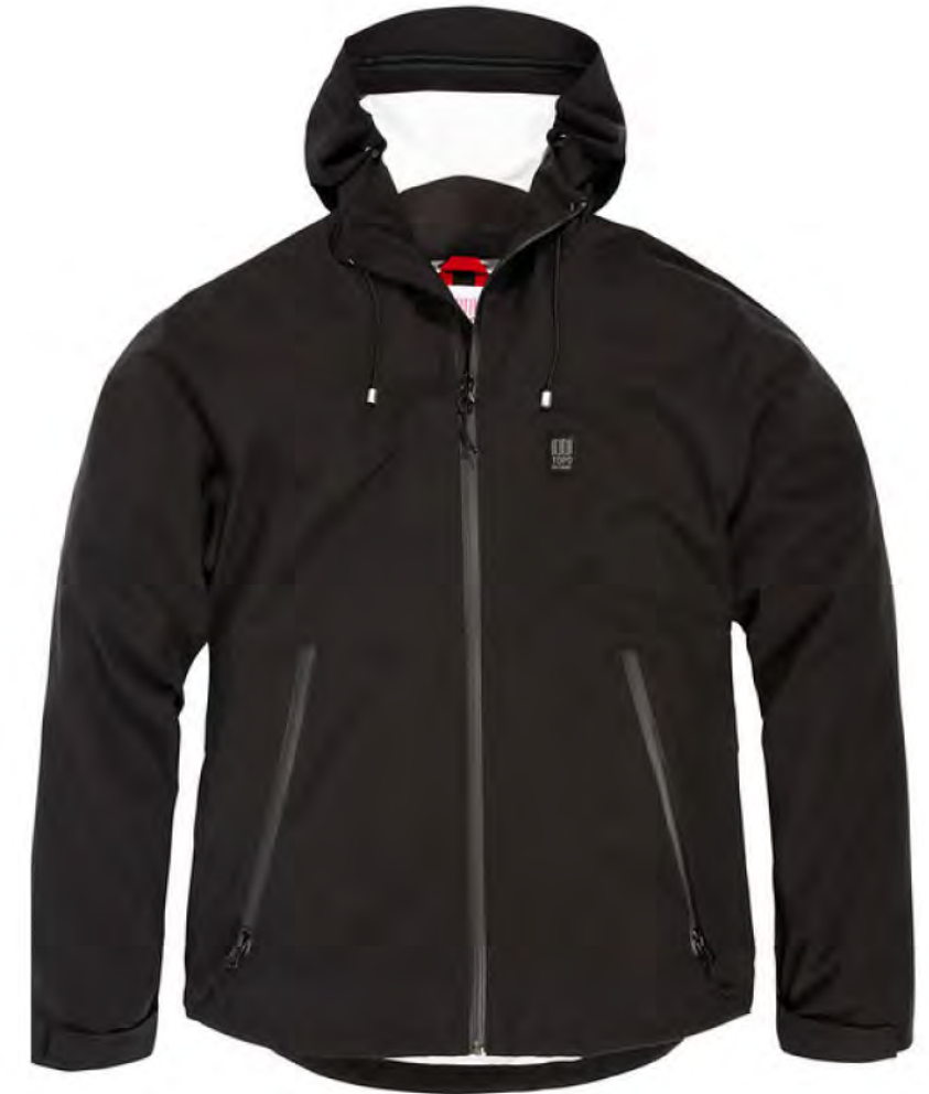
WOMEN'S - BLACK SIZING XS-XL