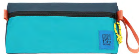
TILE BLUE/POND BLUE