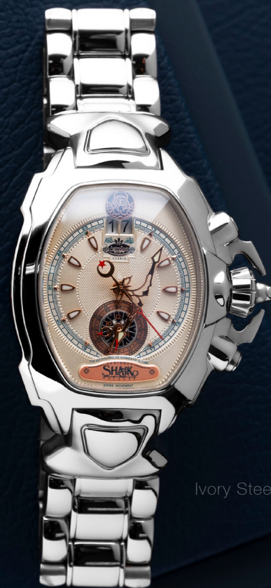
Ivory Steel Gold