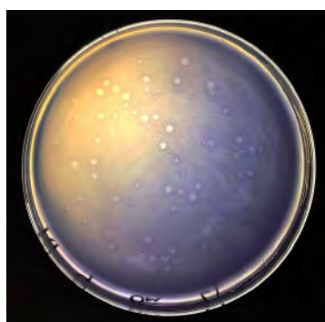
SmartAir MS-2 Pfu at 30 minutes