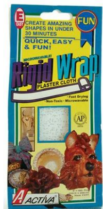
8" X 180"