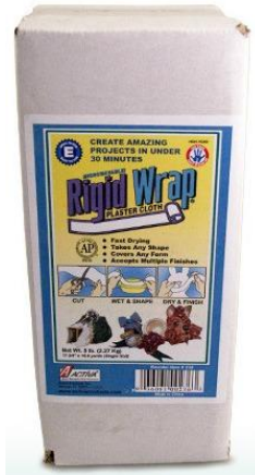
5 LB BULK BOX