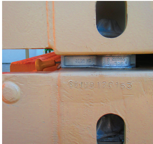
This item can be used to stack ISO Containers