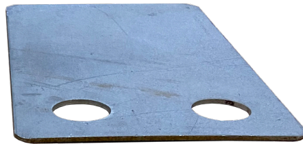
Ø1 7/16" x 2 Holes .125" Thick