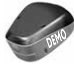
95207 Baha 5 Demo