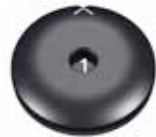
95771 SP Magnet 1