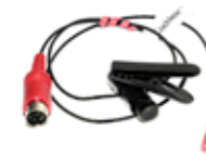
95387 Baha Programming cable CS44 short red (50 cm, 19.7 in long)