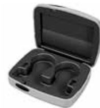
94125 End user case

Not all products are available on all markets.