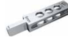
95070 Soft tissue gauge 6 mm

Not all products are available on all markets.