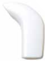
White, 2 pcs Z286007 Standard Z319157 Compact