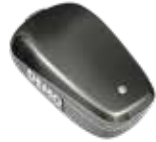
95475 Baha 5 Power Demo