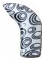
Circles, 2 pcs Z319150 Standard Z319162 Compact