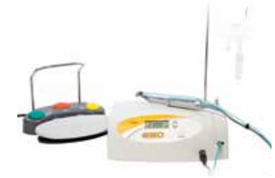
91051 Osscora Surgical set 230V (Europe) 91052 Osscora Surgical set 230V (Asia Pacific) 91053 Osscora Surgical set 115V