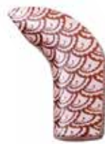
Seashells, 2 pcs Z319149 Standard Z319161 Compact