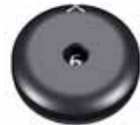
95776 SP Magnet 6