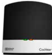
Cochlear Wireless TV Streamer 94760 EU 94761 US 94762 GB 94763 AUS