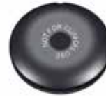
95821 SP Magnet dummy*