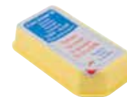
Z60764 Dry Brik by Dry & Store®, 3 pcs