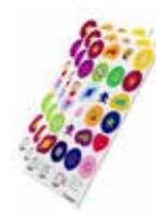
93379 Stickers (3 sheets per pack)