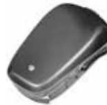
95476 Baha 5 Power Dummy