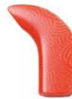
Red Swirls, 2 pcs Z319151 Standard Z319163 Compact