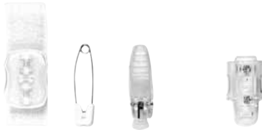
Z327614 LiteWear Fixing Aids Includes: Alligator clip, safety pin, hook & loop.