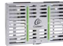
91102 Sterilisation cassette