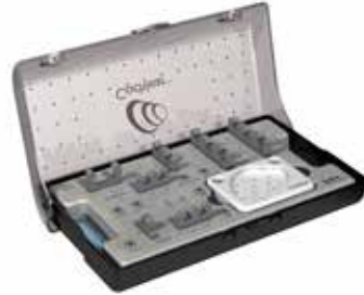
92146 Baha instrument organiser

NOTE: The Baha instrument organiser includes the Component tray (92145), but does not include any instruments.