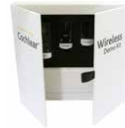
94991 Cochlear Wireless demo kit Delivered empty.

Not all products are available on all markets.