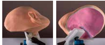
P1571591 ½ Surgical skull model with soft tissue