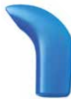
Blue, 2 pcs Z286008 Standard Z319158 Compact