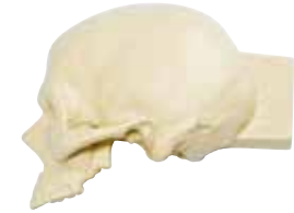
90644 ½ Skull model, plastic temporal bone