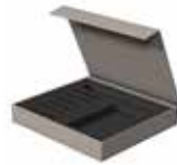
95152 Baha Attract SP Magnet selection kit box

NOTE: The SP Magnets, the accessory box (92933) and any accessories are ordered separately.