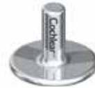
94071 Implant Magnet template