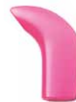
Pink, 2 pcs Z319147 Standard Z319159 Compact