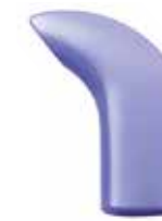
Lavender, 2 pcs Z286006 Standard Z319156 Compact