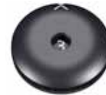
95773 SP Magnet 3