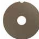
95191 Brown, 3 pcs