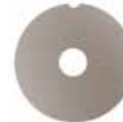
95192 Silver, 3 pcs