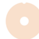
96005 Maize, 3 pcs