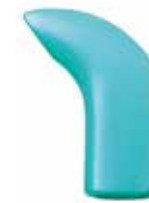
Green, 2 pcs Z286004 Standard Z319154 Compact