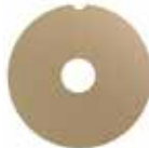
95190 Blonde, 3 pcs

The Colour covers includes a centering pin for easy application.