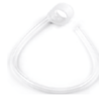
Z300304 Mic Lock