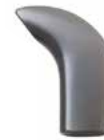
Smoke, 2 pcs Z319148 Standard Z319160 Compact