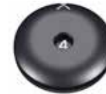
95774 SP Magnet 4