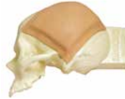
91153 ½ Skull model with soft tissue