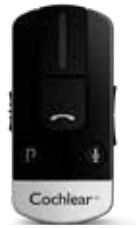
Cochlear Wireless Phone Clip 94770 EU 94771 US 94772 GB 94773 AUS