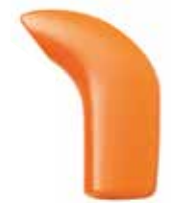
Orange, 2 pcs Z286005 Standard Z319155 Compact