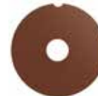
95193 Copper, 3 pcs