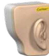
P1607869 Cochlear Ear Model

Not all products are available on all markets.