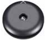
95775 SP Magnet 5