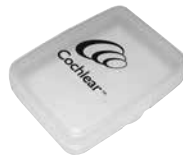
92993 Accessory box