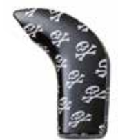
Skulls, 2 pcs Z319153 Standard Z319165 Compact

Not all products are available on all markets.