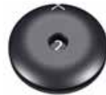
95772 SP Magnet 2