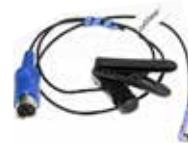
95386 Baha Programming cable CS44 short blue (50 cm, 19.7 in long)