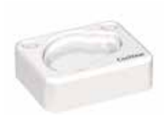
92145 Component tray