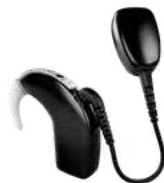
95465 Baha 5 SuperPower Dummy