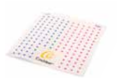
Z339244 Adhesive labels, 15 pcs