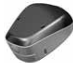
95820 Baha 5 Dummy