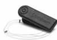
90711 Safety line