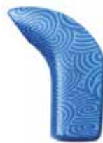
Blue Swirls, 2 pcs Z319152 Standard Z319164 Compact