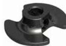
P807181 Baha SoundArc Connector disc