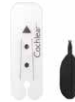
Microphone Protector Applicator with Removal Tool