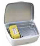
Z325644 Dry aid kits, Europe Z60761 Dry aid kits, Australia