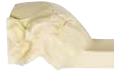
90643 ¼ Skull model, plastic temporal bone