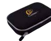
Z342010 Storage case

Not all products are available on all markets.