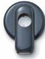
Smoke, Pcs. 2