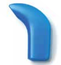
Blue, Pcs. 2