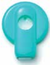
Green, Pcs. 2