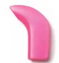
Pink, Pcs. 2