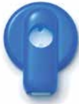
Blue, Pcs. 2