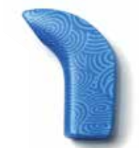
Blue Swirls, Pcs. 2