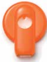
Orange, Pcs. 2