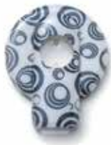
Circles, Pcs. 2