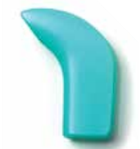
Green, Pcs. 2