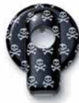
Skulls, Pcs. 2