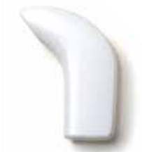
White, Pcs. 2