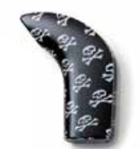
Skulls, Pcs. 2