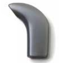
Smoke, Pcs. 2