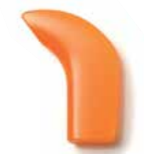
Orange, Pcs. 2