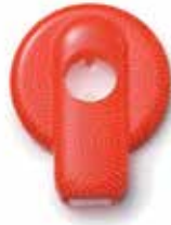
Red Swirls, Pcs. 2