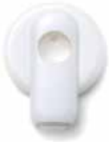
White, Pcs. 2