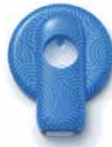
Blue Swirls, Pcs. 2