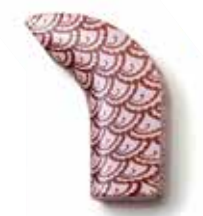
Seashells, Pcs. 2