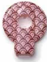
Seashells, Pcs. 2