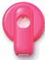
Pink, Pcs. 2