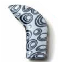
Circles, Pcs. 2