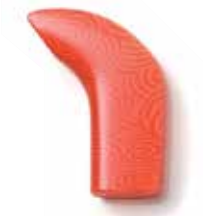
Red Swirls, Pcs. 2