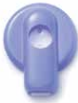
Lavender, Pcs. 2