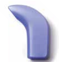
Lavender, Pcs. 2