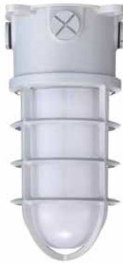
as show with frosted glass