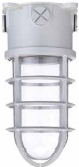
as show with transparent glass