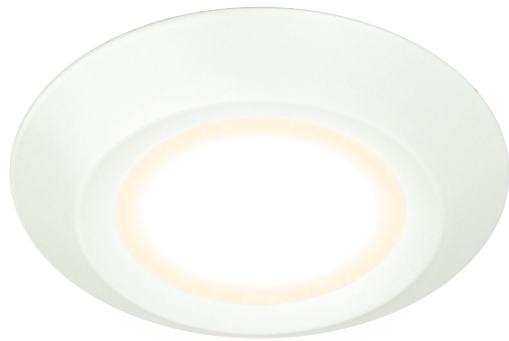
Shown in White