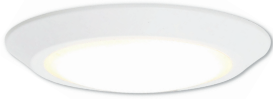
Shown in White